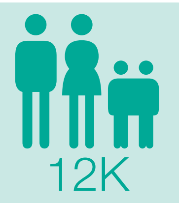
12,000 young people and their families attended our annual Children's Book Festival.

Our website averages more than 73,488 sessions (active engagement) per month. We produced 970 high quality recordings, 1000 podcasts and 2,200 articles online.